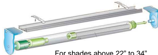
For shades above 22" to 34"